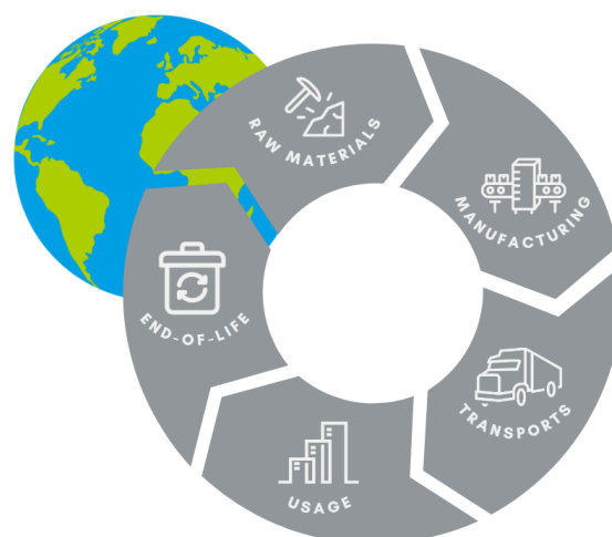
Figure 2. The concept of Life Cycle Assessment.