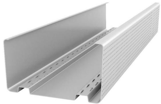
Figure 1. Illustration of one of the products within the product category Steel profile systems, for which this EPD is valid.

Product description: Steel profile systems are construction products used as e.g. beams, struts and attachments and come in different varieties to meet different performance requirements. Properties such as load-bearing, acoustic insulation and mechanical properties vary between different systems. The steel profile systems from Knauf Danogips are made of zinc-coated steel sheets, cut and bent to attain the right dimensions and characteristics. Some profiles additionally have a polyethylene sheet attached. The functional unit is modelled to represent an average of all products in the product category of steel profile systems from Knauf. Figure 1 shows an illustration of one of the products covered by this EPD.